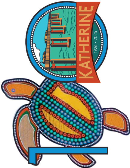
Option 2.2 (Please note this is just an example, this design cannot be used)