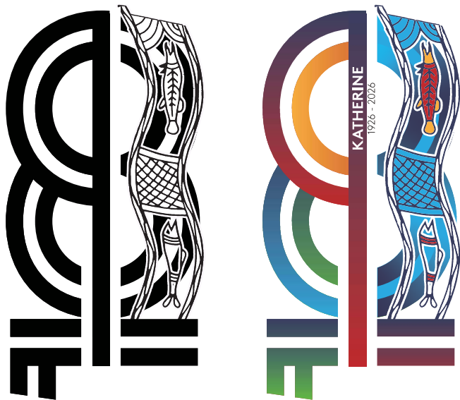
Option 1 Council colours theme