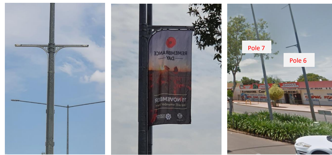
(Double Poles 1, 2, 3, 4, 5 & 9)