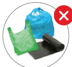
No plastic bags