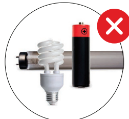
No electronics, batteries or lights