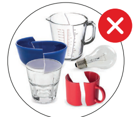
No ceramics and broken dishware