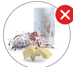
No paper towels, small strips of paper