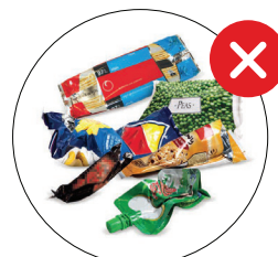
No plastic wrappers