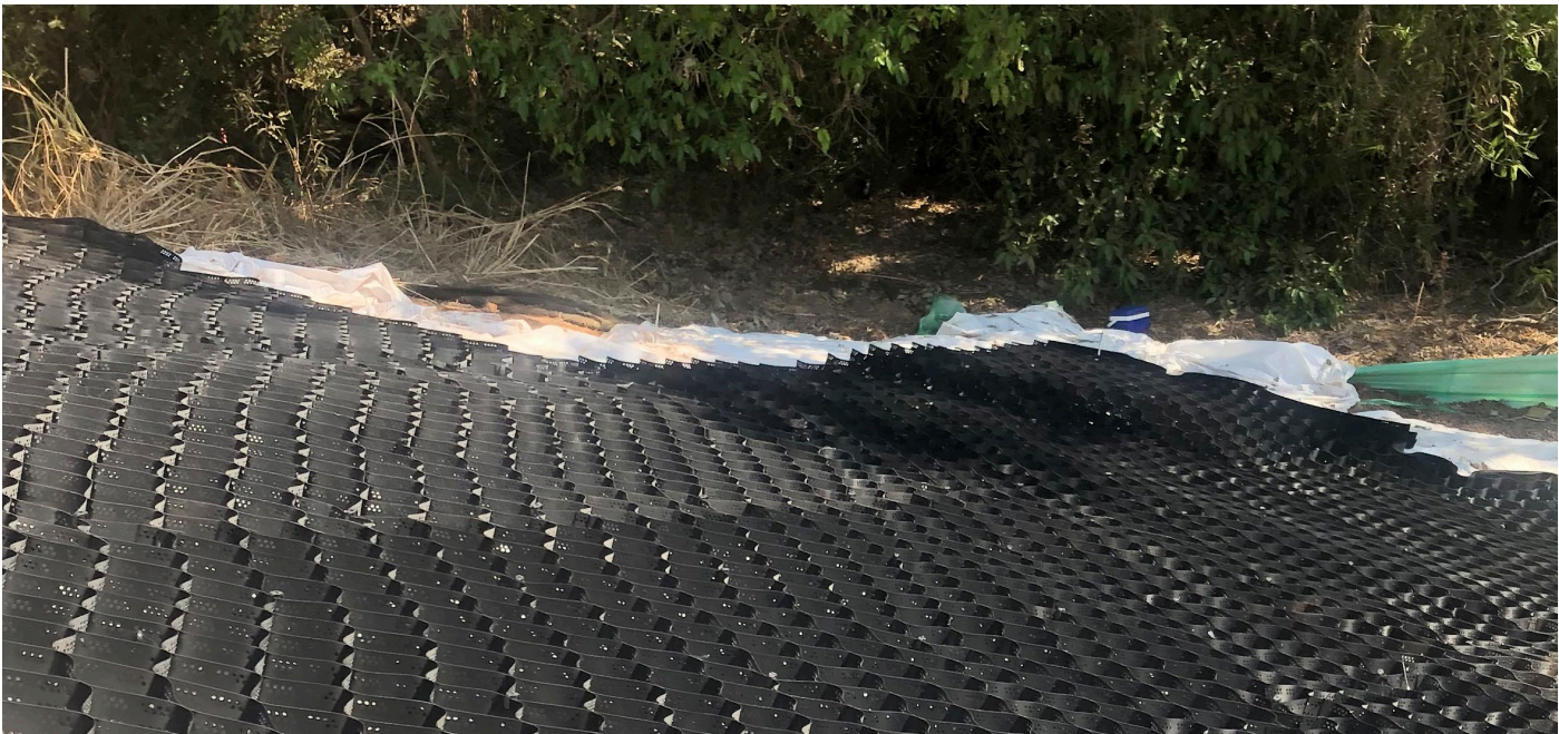
^ Geocell being installed for erosion control measures.

Stage one (1) works included the bank rectification works which are nearing completion and will achieve a significant milestone in a project that has experienced sizeable setbacks. Stage two (2) involves the upper section consisting of park upgrades, landscaping and beautification works. Considering the significance of this community asset, the public’s interest and the length of this project Katherine Town Council considers it is of the utmost importance to see the completion of this project. Despite the significant delays previously experienced, rectification works are progressing well with construction scheduled to be completed by December 2019. Katherine Town Council would like to extend our thanks to the entire community for your patience during this time and we look forward to providing an upgraded asset for the enjoyment of the community and visitors alike.